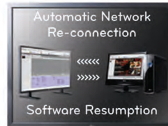
Fault Tolerant System - When network errors occur, Elite provides you a fault tolerant environment minimizing downtime.