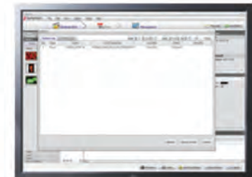
Automatic Log Report - Information regarding display and content are recorded for future reference in an easy-to-read log report.