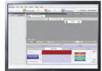
Manager - Customized management display to maximize productivity.