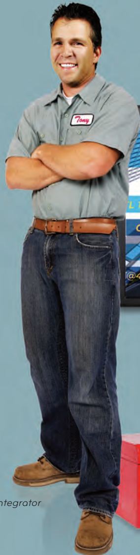
Tony System Integrator