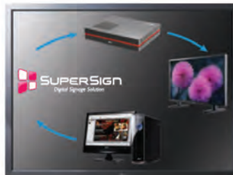
Remote Control - Both the display and external media player can be powered on and off and software upgrades can be installed through LAN.