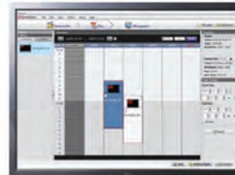
Scheduler - Easy and efficient scheduling.