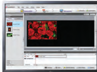
Content Editor - Allows easy editing of content.