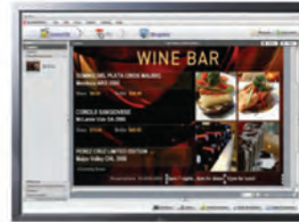
Pre-defined Template - Customized templates designed for various industries.