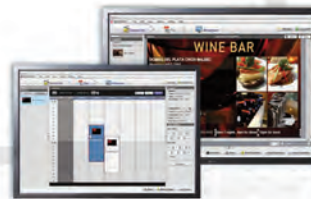
Scheduling and Playback Software with Templates