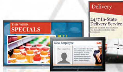
LCD Displays from 32" - 65" class