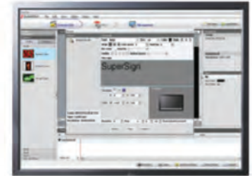
Urgent Message - Digital bulletin board to display various information and emergency notices.