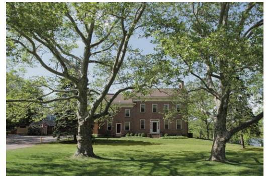
JK Design's Headquarters

The N4B2 has also allowed JK Design the ability to have multiple users on different operating systems such as Windows, Linux and Mac, access their files while directly connected to the NAS, or remotely from a network over the Internet. LG's NAS makes it possible to load and share Blu-ray discs, DVDs or CDs among many networked users by creating and storing an image of a disc to create a virtual disc library.